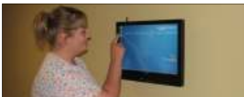
Touch-screen Point-Of-Care wall mounts.

There are a number of new, innovative features at the Warroad Senior Living Center. Radiant ceiling heat above the windows allow for a warm, cozy and draftless view of the outdoors. Touch-screen Point-Of-Care computers mounted on walls give our staff quick access at their fingertips for accurate charting. Our urgent response system offers peace of mind in the event of an emergency for any of our residents. With just the touch of a button, our certified staff will be notified if any of our residents need immediate help.